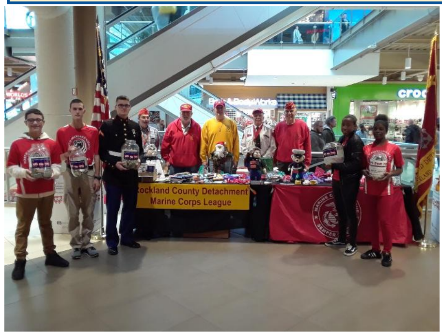
(Top left) Rockland County Detachment at the Palisades Mall along with the local JROTC. Nothing like advertising the league AND collecting toys.