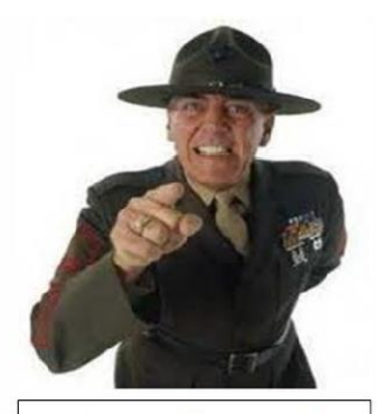
Get your butts out there and support your Detachments!!

Get to a Meeting and attend those Growls!!!