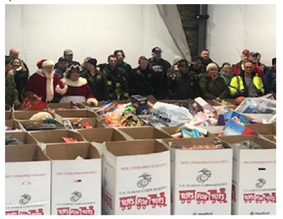
(Above) A small portion of all the toys Brooklyn#1 Detachment collected this year.