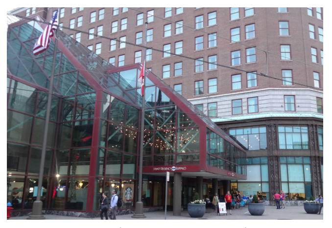
(above) The main Convention Hotel

In August we had the National Convention, this year hosted by the Department of New York and what a convention it was. With 7 hotels set up for us, and at least 4 of them fully booked. It was a blast. it was a long ride from Staten Island, but it was really worth the visit. There was something going on everyday.