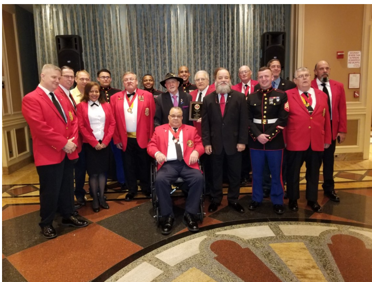
(above) Here's a picture of the Brooklyn #1 at their ball.