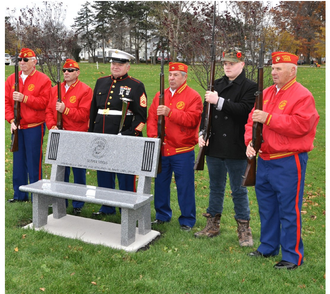
(above) Veterans Day November 11, 2018 - The Honor Guard of the 2 Lt. John Paul Bobo Detachment 1118 present arms by the Marine Bench they donated to the American Veterans Memorial Monument in Niagara Falls, N.Y.