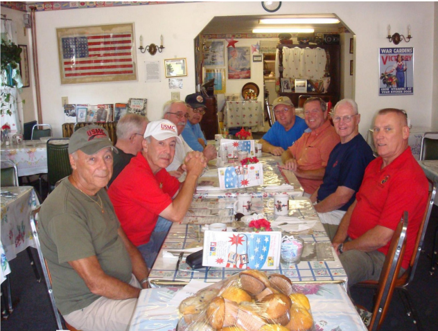
(above) Every fourth Wednesday of the month, the Electric City Detachment has a Breakfast Gathering. Time to enjoy their fellowship. Here as some of their members