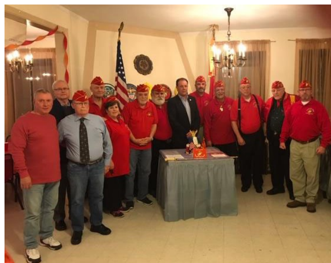
(above) Yankee Detachment gathers for their ball at their detachment club house in the Bronx.