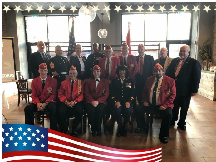
(above) Ulster Detachment gathers for their ball in Kingston