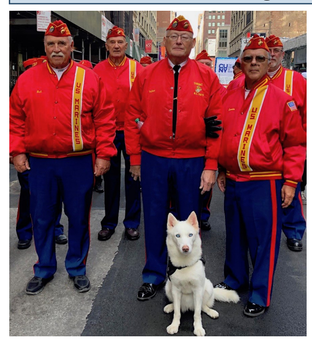
(Above left) Detachment members from Long Island and Staten Island march in the New York City Veterans Day Parade. (and one 4 legged wannabe.)